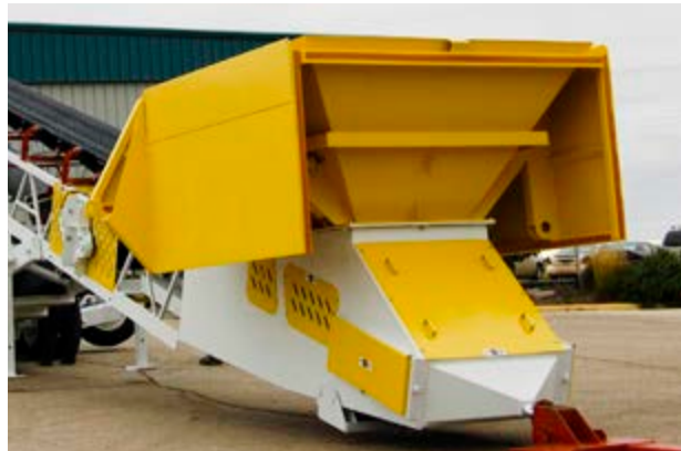
MODULAR 3-SIDED HOPPER W/ FOLD UP WINGS