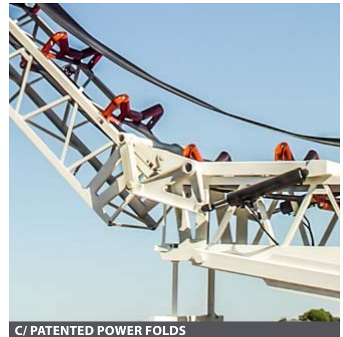
C/ PATENTED POWER FOLDS