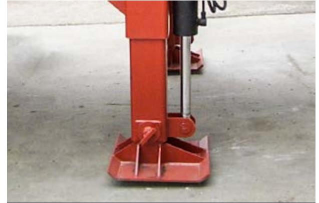
HYDRAULIC LANDING JACKS