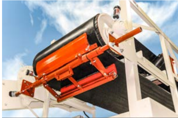
EXTERRA® SFL DUAL BELT CLEANER