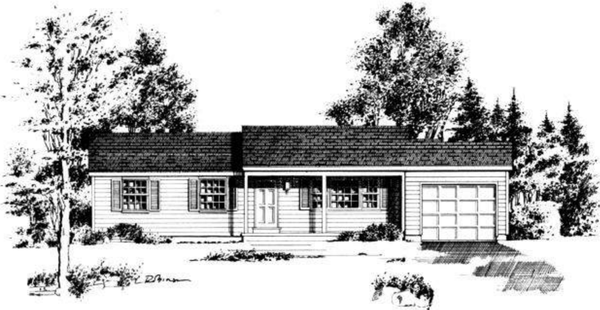
THE BARCLAY 1157 Sq. Ft.