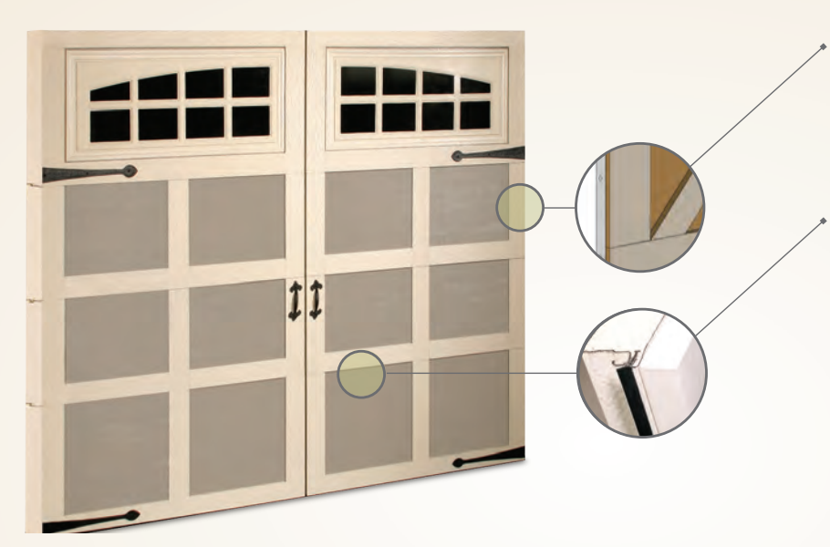
Model 162E 7' high, White/Sandstone finish, Somerton windows, decorative hardware