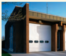
Thermacore® Sectional Doors