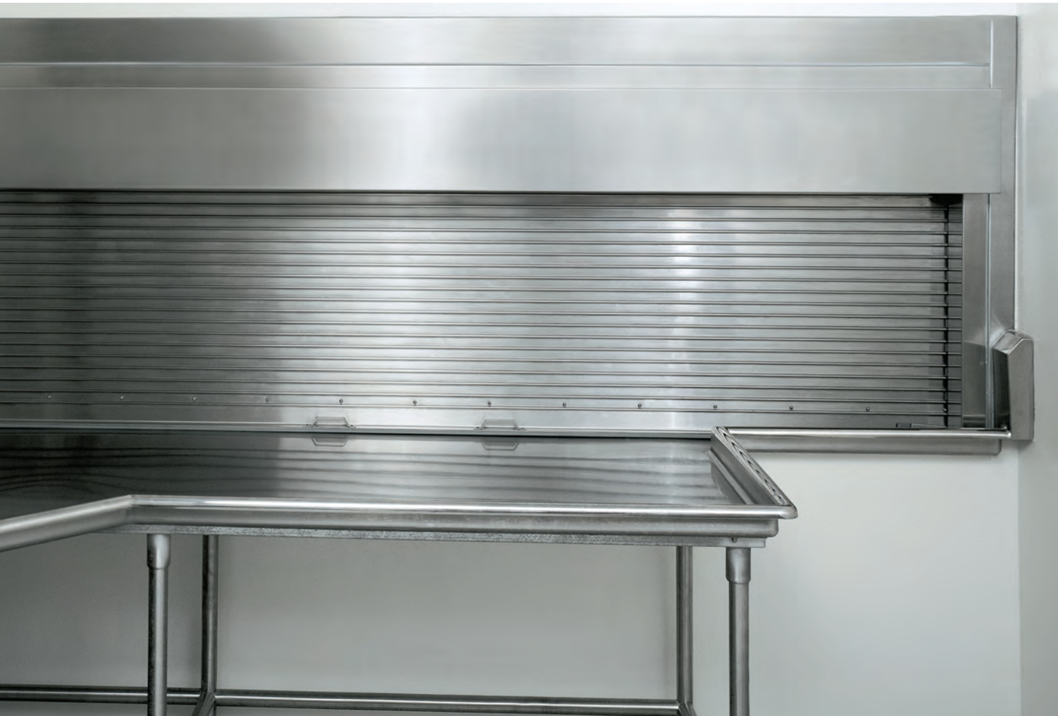
Door Selection Guide