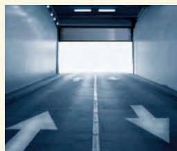
Advanced Rolling Steel Door RapidSlat®