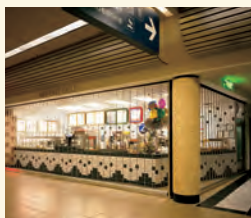
Rolling & Side Folding Security Grilles & Closures