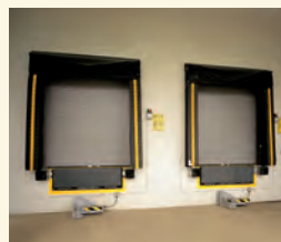
Rolling Service Doors