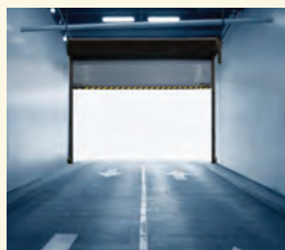
Advanced Rolling Steel Door RapidSlat®