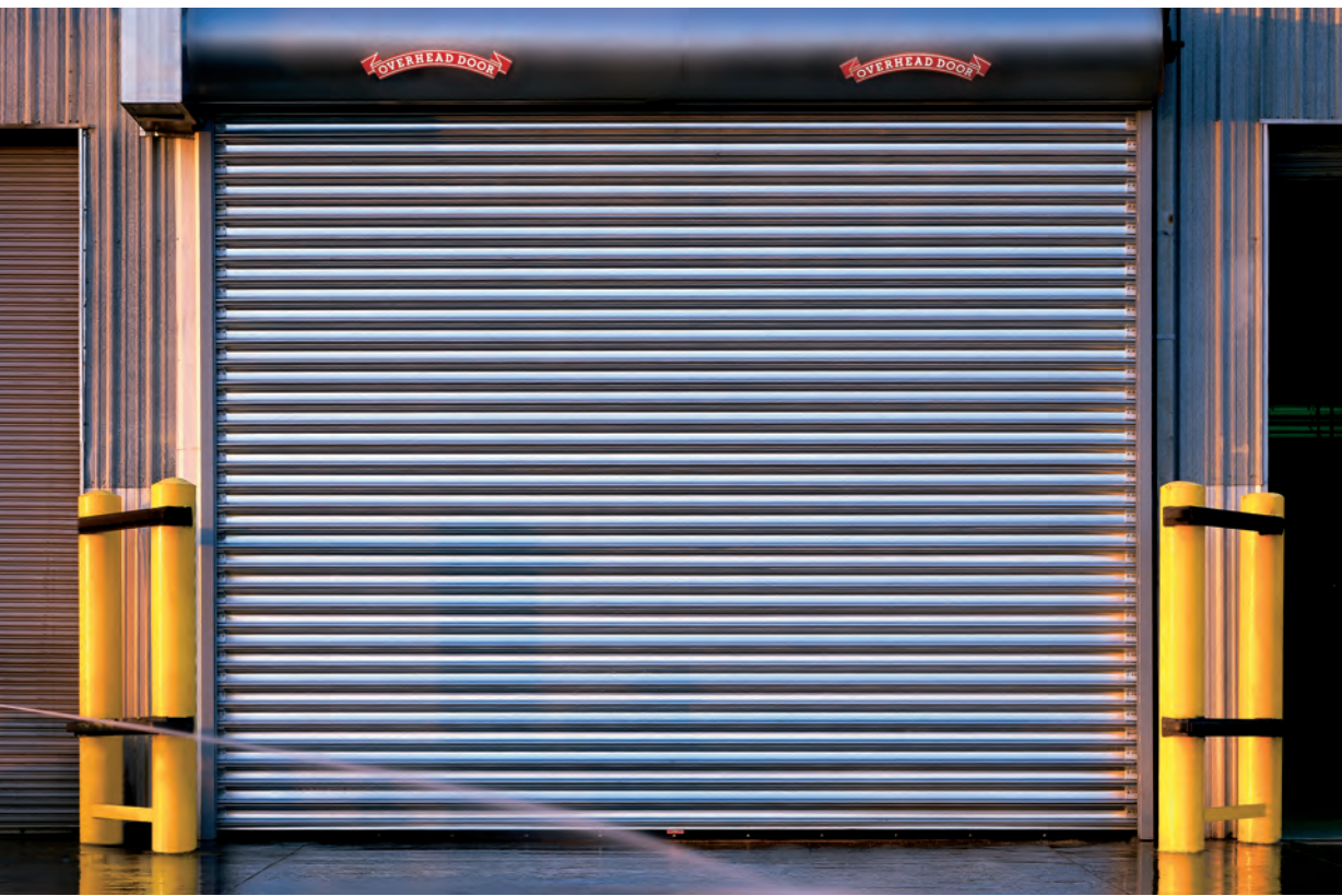
Installation and Service: Overhead Door Company of Longview