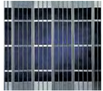
681, Straight Pattern