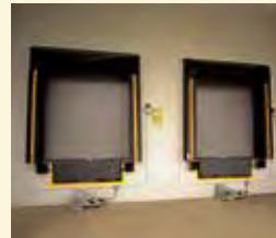
Rolling Service Doors