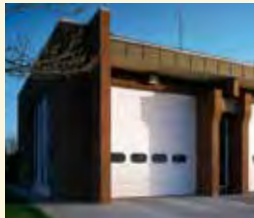
Thermacore® Sectional Doors