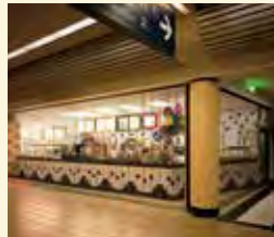
Rolling & Side Folding Security Grilles & Closures