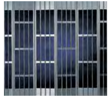
681, Brick Pattern