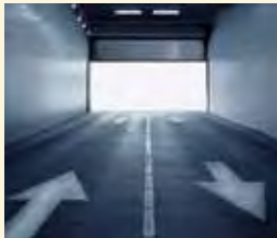
Advanced Rolling Steel Door RapidSlat