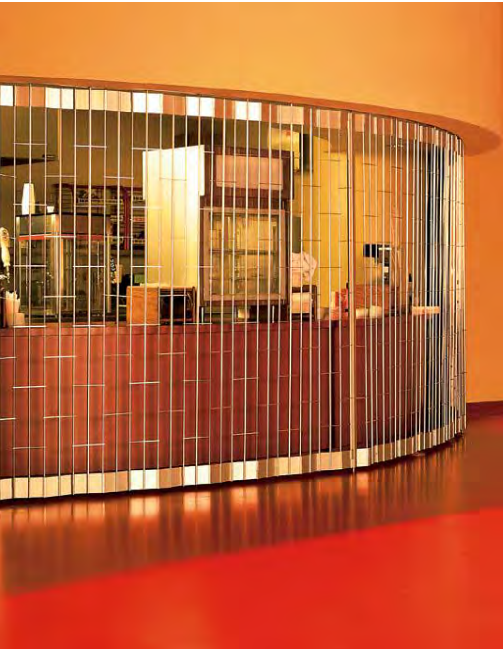
681 side-folding open air grille. Installation and service: Overhead Door Company of Madison.