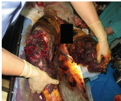
COMPLEX COMBAT WOUND WITH OPEN FRACTURES, TRAUMATIC AMPUTATIONS AND SEVERE BURNS