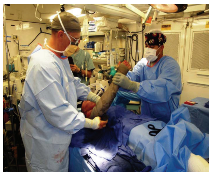
SILVER-NYLON DRESSINGS APPLIED IN THE OPERATING ROOM AT A COMBAT SUPPORT HOSPITAL IN AFGHANISTAN, 2011