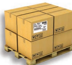
A single scan identifies and tracks every item on the pallet