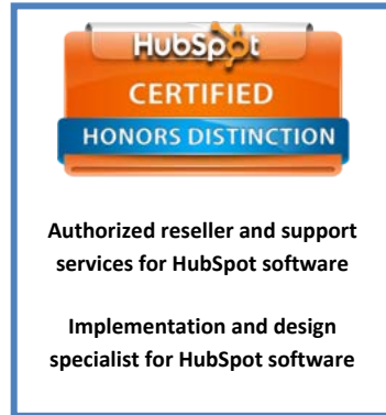
Image Media Partners provides consulting, implementation and support services for on-line and inbound marketing. We specialize in inbound marketing and related services. We are available for all levels of service from consultation through design, implementation and support.