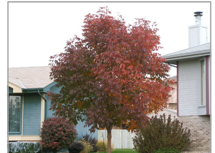
Autumn Blaze Ash Tree, fall color

By fulfilling the requirements for certification, our arborists are continually updating their skills and knowledge regarding the best tree care practices, leading to the best care for your trees. Our arborists are here to answer your questions, diagnose your tree issues, and provide them with continued care. Please do not hesitate to seek their advise and services. Contact a CM's certified arborists with your tree question and concerns.