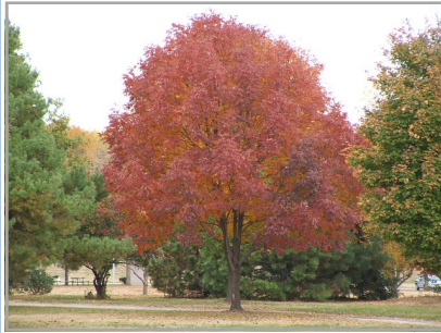
Autumn Applause Ash Tree, fall color

pests and disease that affect us specifically here in Nebraska, and the unique challenges we face with our heavy clay soil. After passing the exam, applicants may then apply for certification, where they also must provide a Red Cross First Aid and CPR certification and a copy of the Public Liability and Workmen's Compensation Insurance carried by their employer.