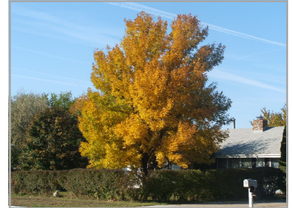
Green Ash Tree, fall color

The organizations that offer certification programs in Nebraska are the Nebraska Arborist Association (NAA) and the International Society of Arboriculture (ISA).