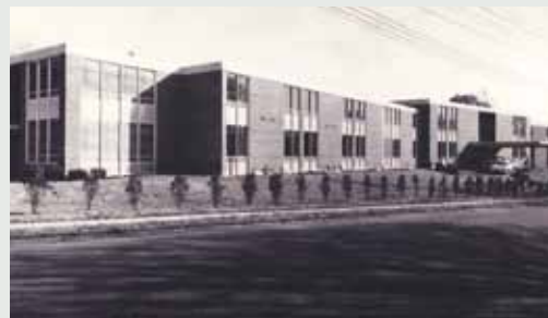
The Marjorie P. Lee Home opened.