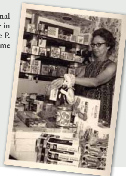
The original corner store in the Marjorie P. Lee Home