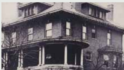
Bishop Theodore Irving Reese Home in Clifton served as the first location of the Memorial Homes Foundation.