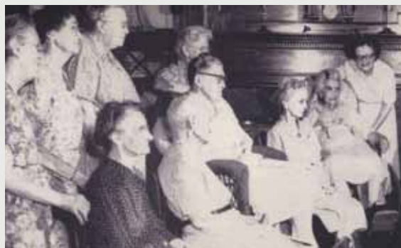
Residents at the Reese Home were served by the Memorial Homes Foundation, a precursor of ERH.