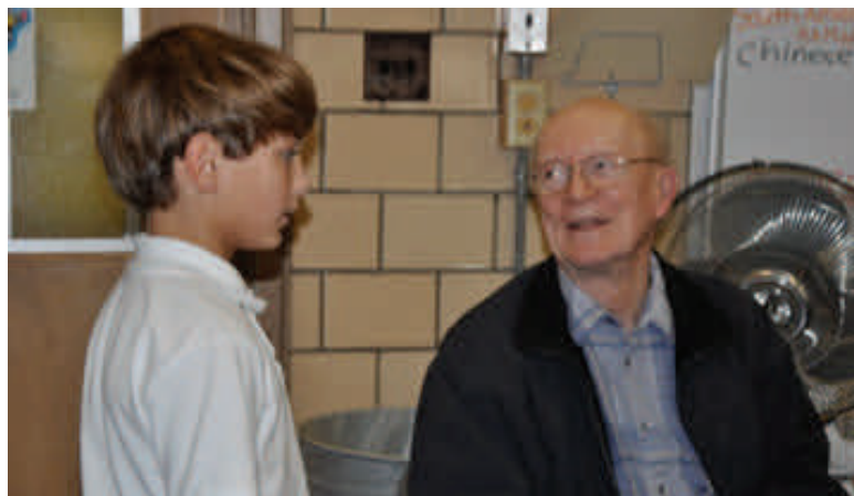
Even after the session was over, some students had more questions.

Answers: 1.) 4 minutes; 2.) Basketball; 3.) 5 miles