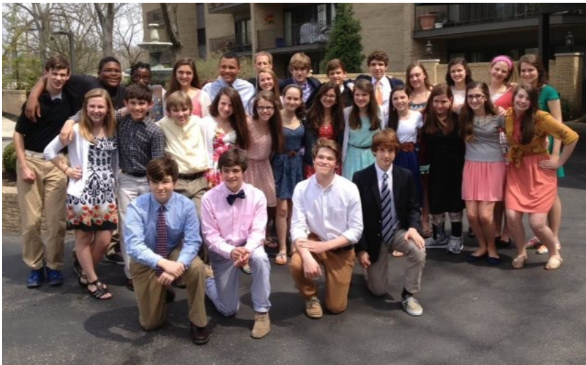
Nativity’s 8th grade class thanks the DH and MPL residents for sharing knowledge and experiences.