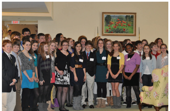
The 8th grade class from Nativity come to Deupree House for lunch.

When the students returned to school, they reflected on the two-part series. The sentiment was that the sessions were worthwhile and should be repeated for other 8 th grade classes in the future. One student remarked that the etiquette portion