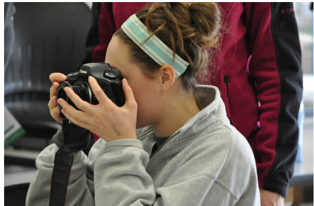
Students are with fascinated Dan’s Lensbaby camera