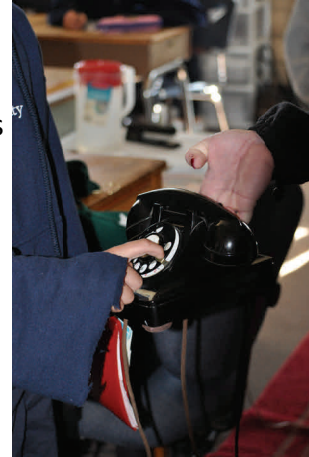
A rotary phone for demonstration