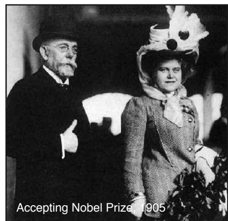
Accepting Nobel Prize 1905

But Koch also wanted to know whether anthrax bacilli that had never been in contact with any kind of animal could cause the disease. He obtained pure cultures of the bacilli by growing them on the aqueous humour of the ox's eye. By painstakingly studying, drawing and photographing these cultures, Koch recorded the multiplication of the bacilli and noted that, when conditions are unfavourable to them, they produce rounded spores that could resist adverse conditions, especially lack of oxygen and that,