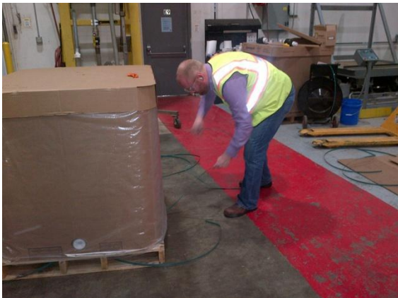
Collect and dispose of strapping.