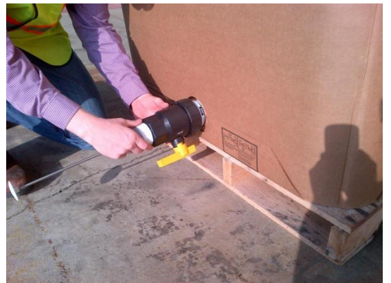
Attach the ball valve assembly to the dispense gland. Once the gasket on the valve seats to the gland, do not over tighten – hand tighten only . Valve is tight between the 10 and 2 o'clock position.