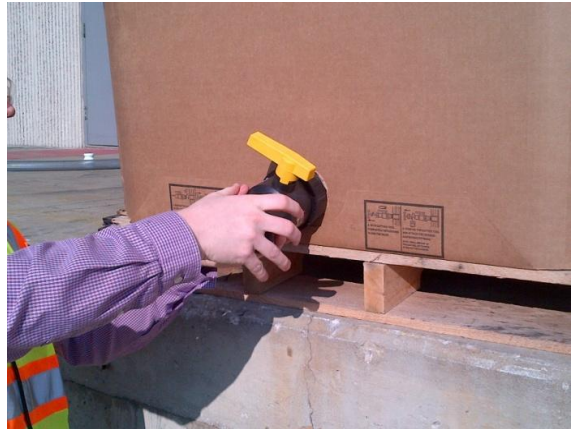
Close ball valve and remove by turning counter-clockwise.