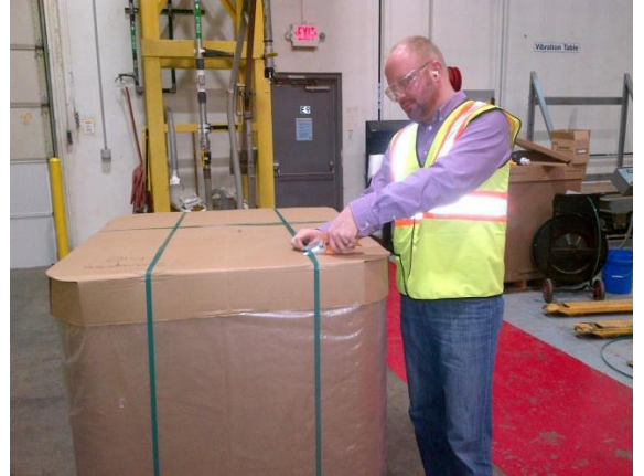
Remove all 4 straps from the tote.