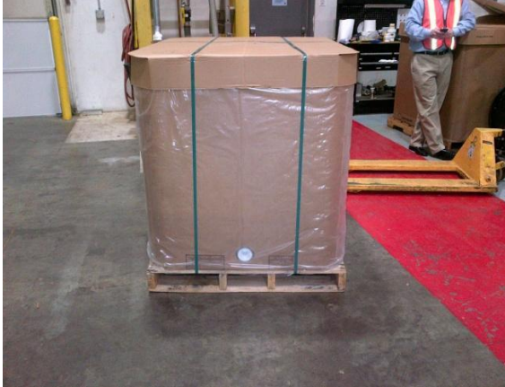
Tote will arrive as pictured.