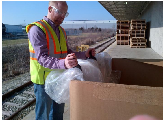
Remove spring-loaded clamps from the front of the tote.