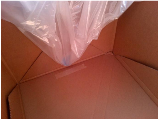
Liner position on inside of tote when completely pulled forward and product completely dispensed from tote.