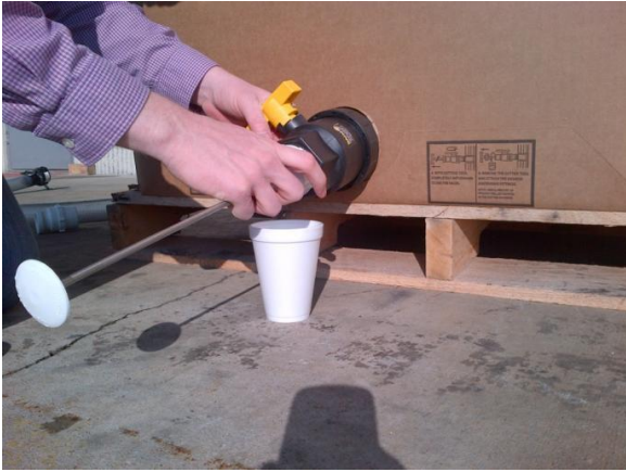
Remove the plunger tool from valve and allow the ½ - 1 cup of product to drain into container.