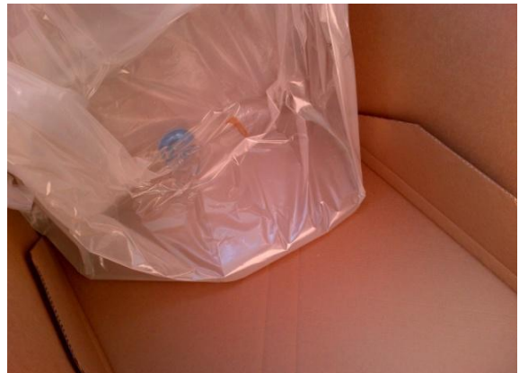
As the liner is pulled forward, the liner and product will move towards the front of the box. This allows the product to be completely dispensed.