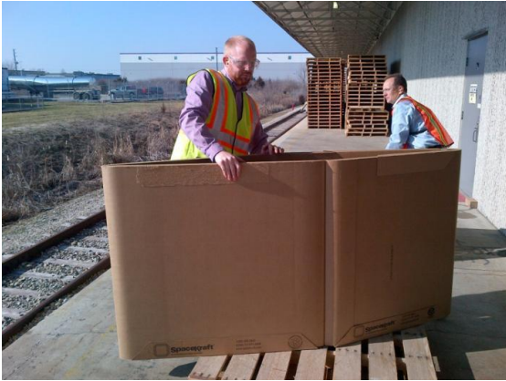
Pull sides of the tote together to close the tote.