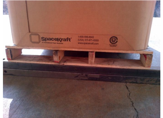
OPTIONAL: Tote should be elevated, with the back side of the tote having a 4" incline.