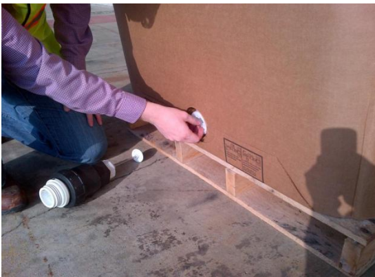
Remove dispense gland cap. Keep the cap in a safe place as it will be replaced when tote is empty.