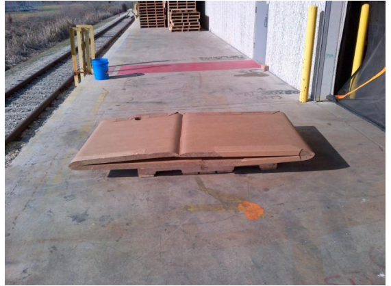
Tote will lay flat and can be recycled.