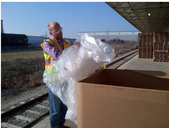
Remove the empty flexible inner liner and dispense in standard waste stream.