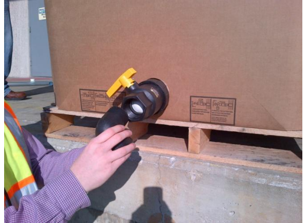
Attach a 2" male camlock or tri-clamp fitment to discharge side of valve. Hook up female camlock/tri-clamp/hose and turn valve handle to start dispensing.