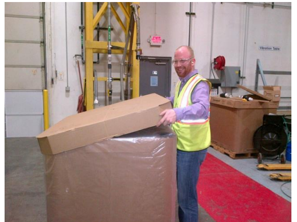
Remove corrugated cap and recycle.