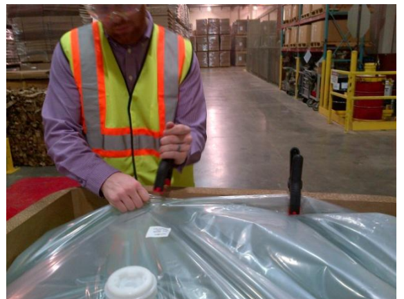
OPTIONAL: Using 2 spring-loaded plastic clamps (available at any hardware store). Clamp a small amount of the product liner to the edge of the tote side that has the bottom dispense hole.