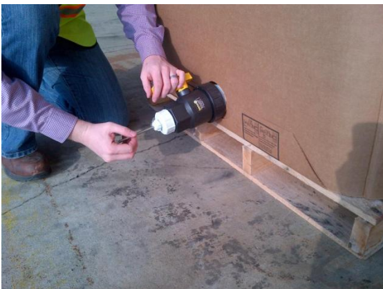
With valve handle in the open position, push the plunger tool straight through the valve one time and pull straight out. Do NOT twist the plunger tool.