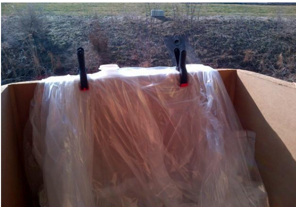
Inside of the box with liner pulled forward.