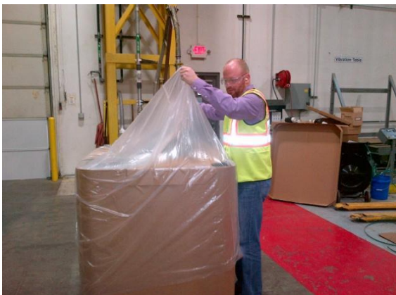
Remove poly shroud. PLEASE NOTE: Not all totes use these.