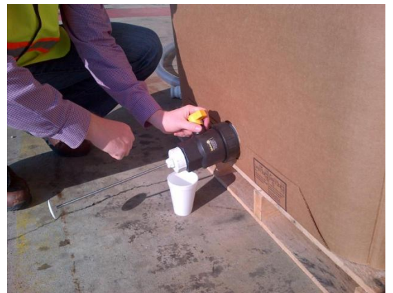
IMPORTANT: Close the valve and place a small container under the valve. There will be ½ - 1 cup of product between the internal ball and end of the valve.