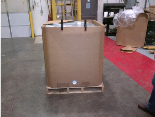
Tote is prepared for dispensing.