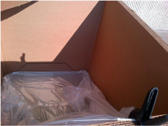
As dispensing progresses, the liner inside of the tote will begin to collapse. The 4" tilt will keep the product moving towards the dispense outlet.