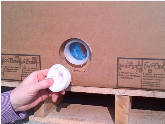
Replace bottom dispense cap.