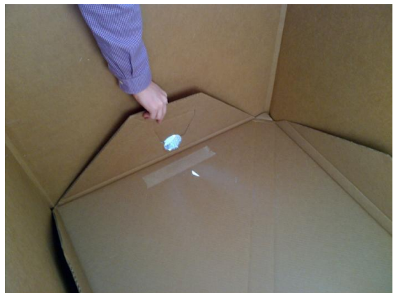
Remove bottom pad by grasping one of the flaps and pulling the pad up and out of the tote.