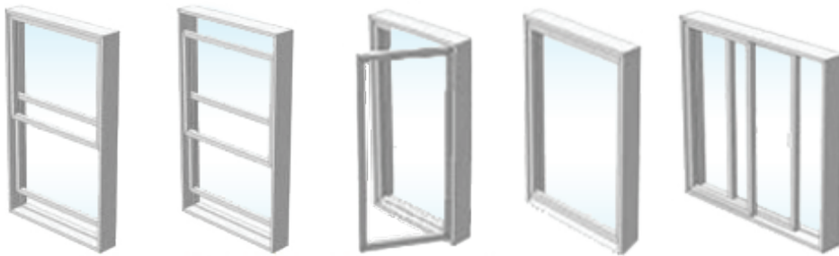
Single Hung • Double Hung • Casement • Fixed/Picture • Horizontal Roller Sliding Glass Door