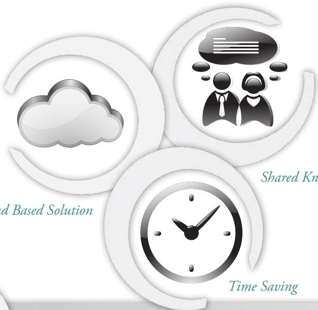
Cloud Based Solution

This collaborative approach allows our customers to rapidly adapt to the system while quickly implementing new information supplied from other providers into your practice.