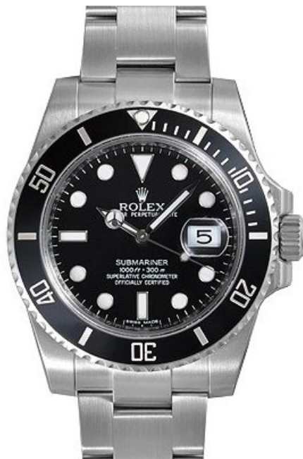
Rolex Submariner Date Stainless Steel Mechanical Self-winding Watch 40mm Waterproof 300mm Retail: $8,550

We recommend the Rolex Submariner in steel. Not only is it the most classic and recognizable watch on the planet... it's also a ROLEX! It's built like a tank so you can live life fully while wearing it, and it sells for $8,550. When you've reached this level of success, you should have a Rolex Submariner in your collection.