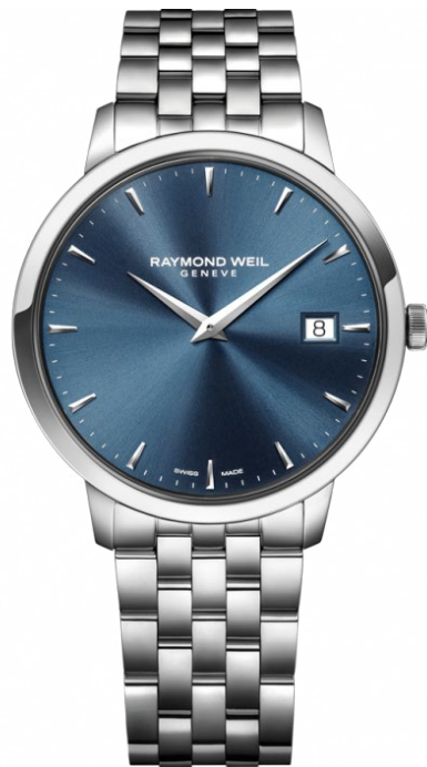
Raymond Weil Tocatta Stainless Steel Quartz Movement Retail: $760

You're moving up in the world and now you are responsible for managing others at work. You need to look the part as much as you act the part, so we recommend your first dressy Swiss watch. Introducing the Raymond Weil Tocatta, priced at $760 retail. It screams professional but is still youthful enough to match your early success in life.