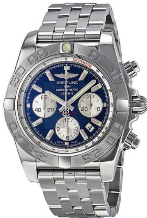
Breitling Chronomat Stainless Steel Automatic Movement Watch 44mm Water Resistant 200mm Retail: $9,060

For someone who wants something different and cutting edge, we'd recommend the Breitling Chronomat in steel. It's big, it's bold, it has an incredible 5 year warranty. And it retails for just over $9,000.