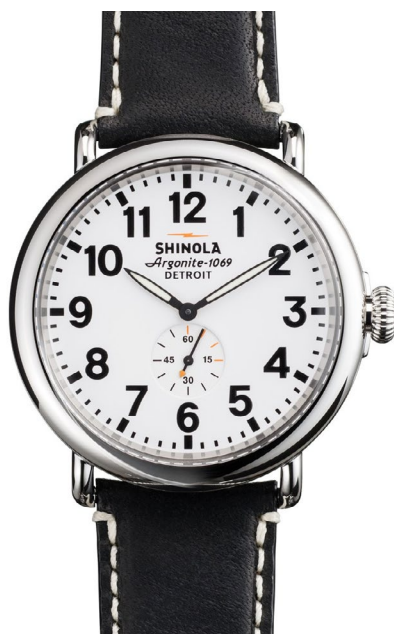
Shinola Runwell Stainless Steel Quartz White Dial 47mm Retail: $550

You've graduated, and you're about to enter the working world. You need a timepiece that reflects your ambition to make an impact and your professional drive, without being too stuffy or old fashioned. We recommend a Shinola 47mm Runwell (retails for $550). It's a cool brand with a great look, it can be worn in both professional and casual settings and it will last for a lifetime. The best part is that Shinola is made in Detroit, so you can proudly talk about and show off your American Made watch.