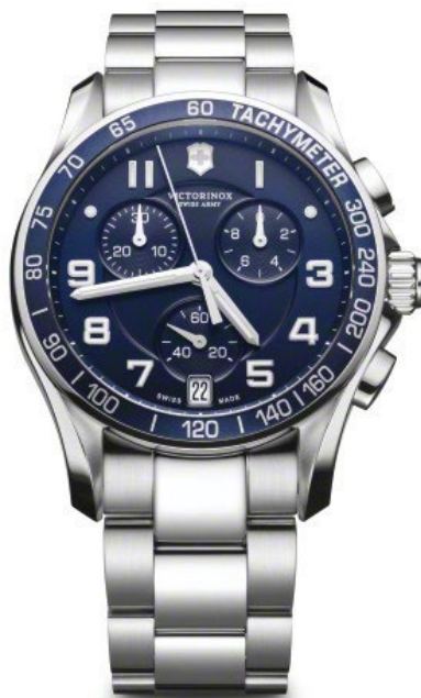
Victorinox Swiss Army Stainless Steel Chrono Classic Swiss Made Quartz Chronograph Movement 41 mm Water Resistant 100mm Retail: $625

Swiss timepieces are the finest in the world, so after your first promotion it's time to treat yourself to something a little more special. We recommend a watch that still has a sporty feel, while still looking great when you wear it to the office, the bar or the beach. Go with a Victorinox Swiss Army watch, such as this steel Chrono Classic, which retails for $625. Plus, it is water resistant to 100 meters, so it's ok to wear it all the time!