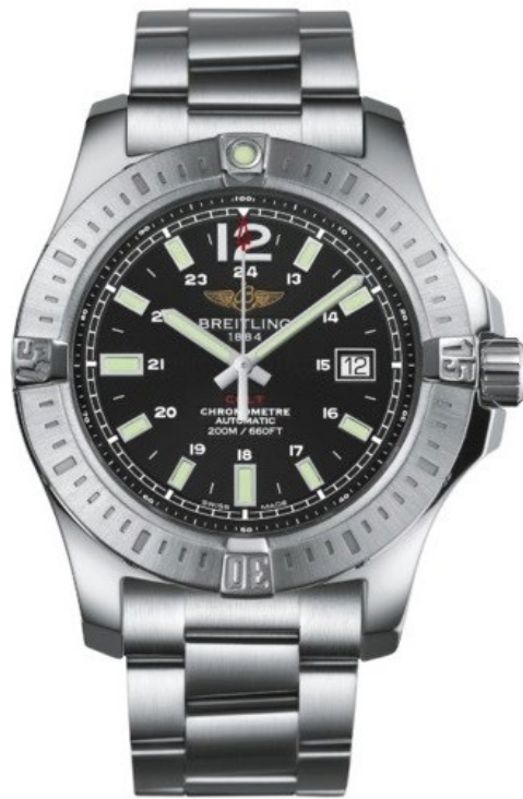
Breitling Colt Stainless Steel, Automatic Movement 44mm Water Resistant 200mm Retail: $3,525

If you want more of a modern look, we recommend the incredible Breitling Colt. It's the modern man's watch and an automatic model retails for around $3,500.