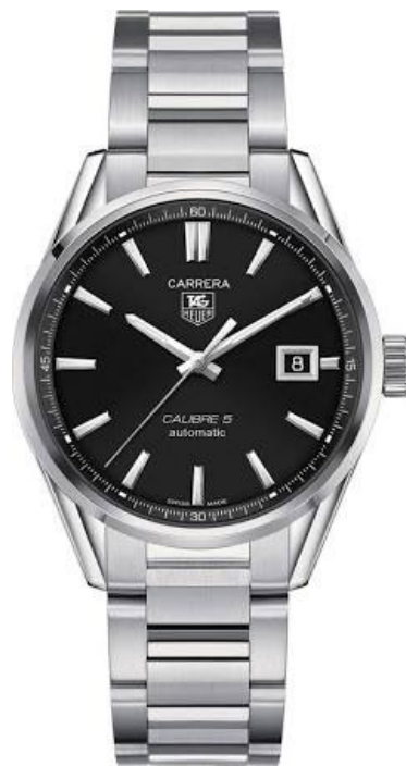
TAG Carrera Stainless Steel Automatic Movement Black Dial Watch 39mm Water Resistant 100 Meters Retail: $2,900

Eventually you will decide it's time to settle down and get married. She gets a beautiful engagement ring and you deserve an automatic, self-winding fine timepiece. We recommend a TAG Heuer Carrera in steel for under $3,000. Now we've entered the realm of great Swiss brands so get ready for other people to recognize the brand on your wrist. You'll start to get used to people complimenting your style with this watch.