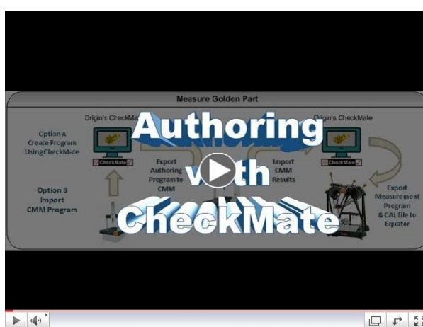
Origin International CheckMate Authoring

Origin's authoring software will allow almost immediate use of the Renishaw Equator™ after measurement of the golden part.