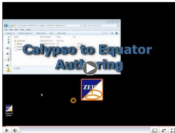
Origin International Inc. Calypso to Equator Authoring

Check out this video on Calypso to Equator™ Authoring Origin's Calypso to Equator™ authoring software will allow almost immediate use of the Renishaw Equator™.