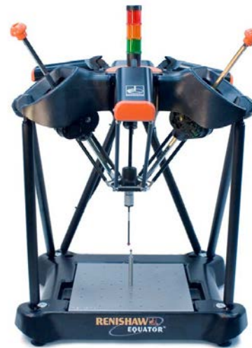
Trademark by Renishaw

Origin will shortly announce a new addition to its proven suite of CheckMate software products. This new software is designed to allow you to Master from your existing CMM , and program the unique Equator Flexible Gauge providing you with a one stop capability. Origin's advanced software analyzes the CMM format data collected by the Equator Gauge allowing the engineer to view the 3D graphical image on his/her screen comparing it to the CAD data from the master. From this information, the tooling may be modified to produce good parts .