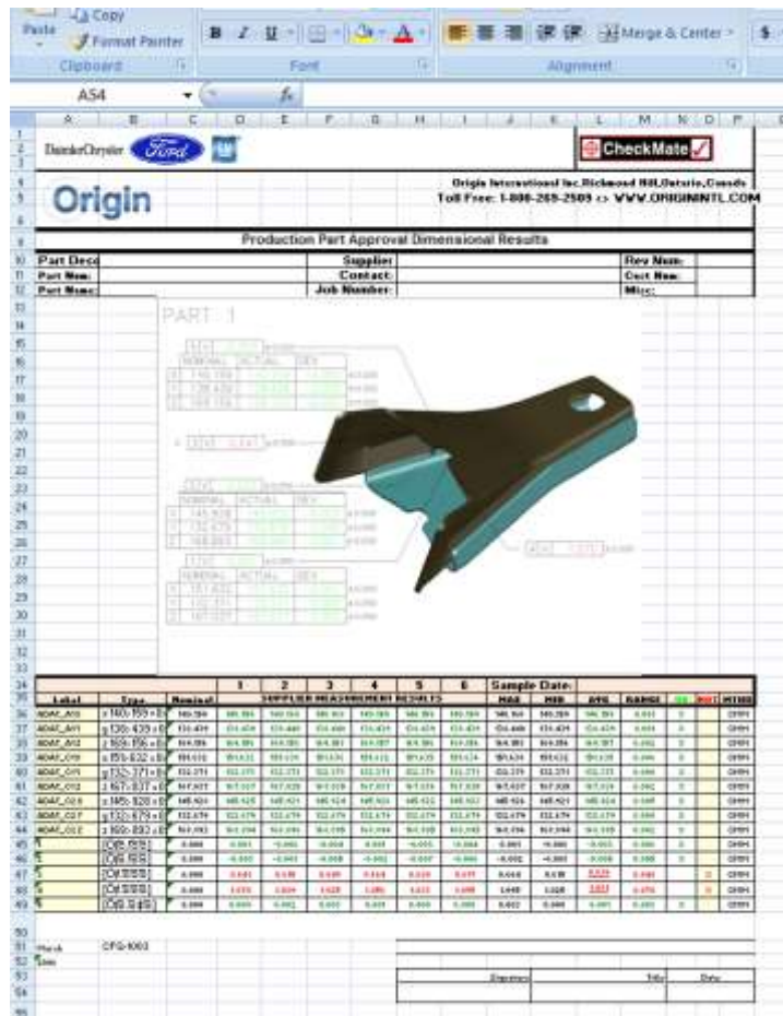
New Excel Reporting System

Introducing Origin's new Excel Reporting System. If you create a CheckMate report in a Layout, CheckMate will insert all of the graphics from a viewport into the selected excel template. CheckMate reports such as ballooned labels, post inspection labels, or whiskers will be automatically recognized. Then, taking it a step further, CheckMate will automatically fill the selected excel template with the results data that belongs to the report in that viewport. Keep your eyes peeled for release dates !