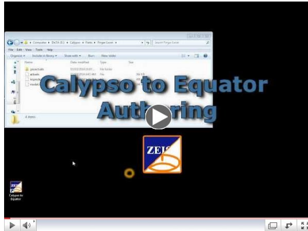
Origin International Inc. Calypso to Equator Authoring