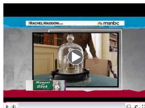
Rachel Maddow- Happy World

May 20th-World Metrology Day celebrates the signature by representatives of seventeen nations of The Metre Convention on 20 May 1875. The Convention set the framework for global collaboration in the science of measurement and in its industrial, commercial and societal application. The original aim of the Metre Convention - the worldwide uniformity of measurement - remains as important today as it was in 1875. Visit the official website or learn about metrology careers .