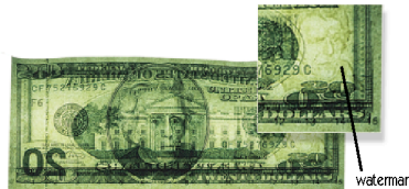
Figure C - Series 1996 and later