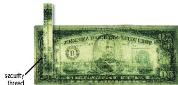
Figure D - Series 1990 through 1995