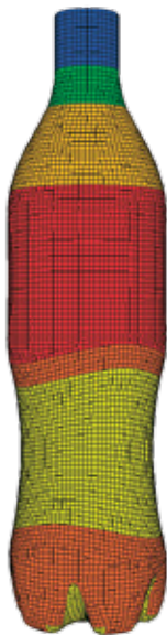
An example of a CO_2 loss rate analysis in Abaqus. A greater proportion of the gas passes through the thinner areas of the bottle.

HPL, Magnitude SVEG, (fraction = -1.0) (Avg: 79%) 2.812e+00 2.432e+00 2.209e+00 2.007e+00 1.805e+00 1.604e+00 1.404e+00 1.203e+00 1.001e+00 799e-01 5.984e-01 3.971e-01