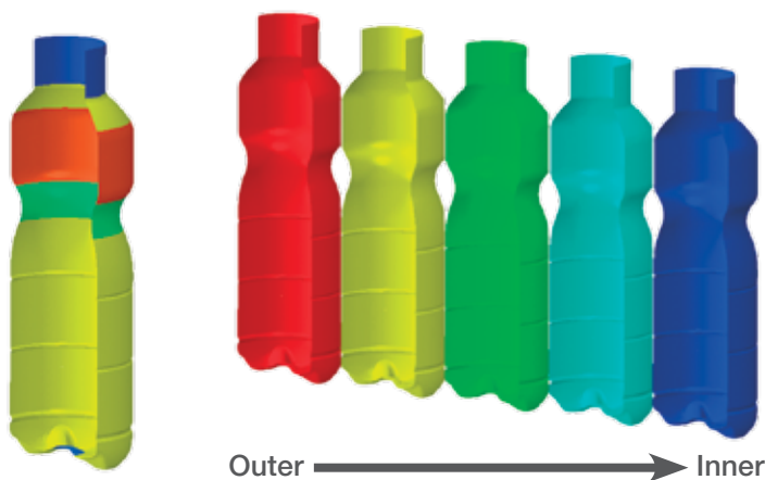
The heat transfer method is an alternative analysis available in Abaqus.

With the heat transfer method, the team could use a different type of 3D element as the building block for their models. Elements, used by the hundreds of thousands in an FEA model, are the mathematical units that describe the object being analyzed. "We found that the 'shell' elements available in the heat transfer method were more efficient," says Dr. Shi. "They use less computational time than the solid 'hex' ones used in the mass diffusion procedure and gave us