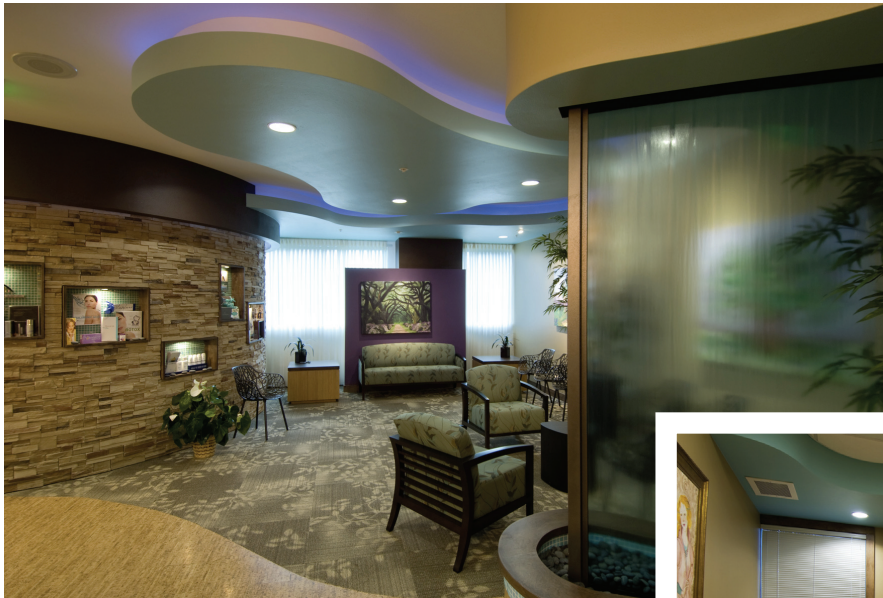
NO BOXY, NO BORING Carlson Studio Architecture turned a typical doctor's office into a sustainable, stylish spa-like space. Lobby focal points are its stone and water walls.