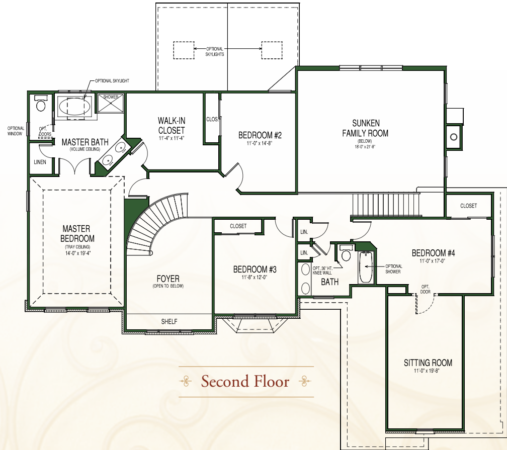
❖ Second Floor ❖

Speak to a sales associate for available structural options.