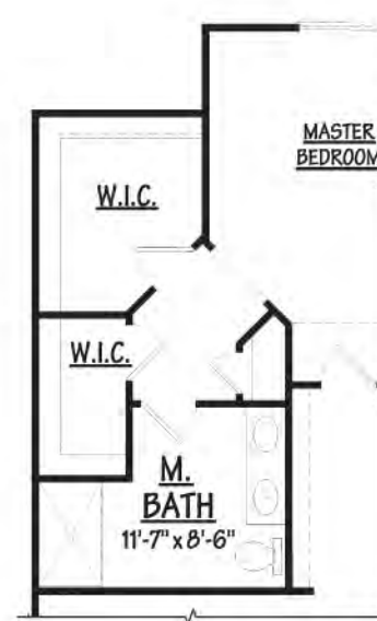
THE KIRKHILL FIRST FLOOR MASTERBATH OPTION