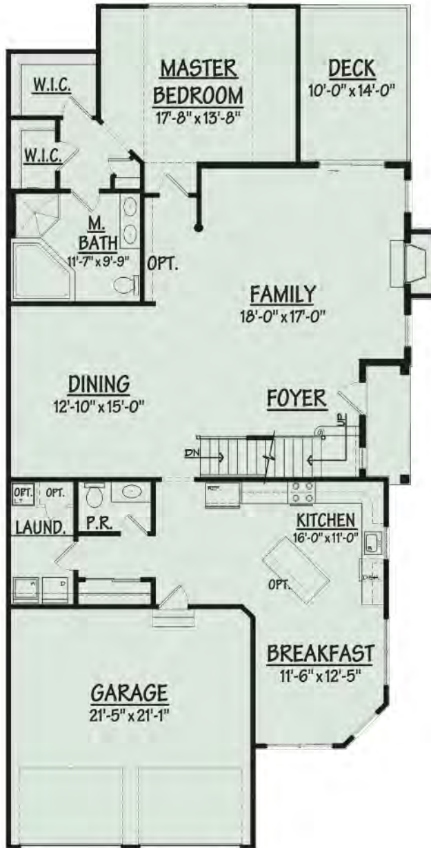
THE KIRKHILL FIRST FLOOR PLAN