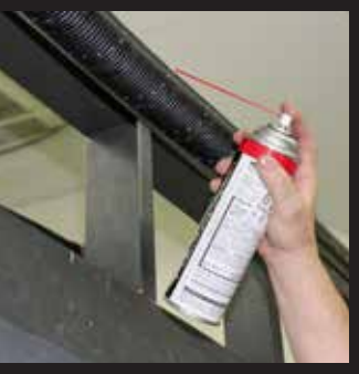
4. Spring Shaft and End 5. Springs (entire surface)

After you apply the spray, open and close the door a few times to distribute the lubricant over all bearing surfaces. The squeaks should be gone. And you'll have peace of mind in knowing that your garage door investment is being properly protected.