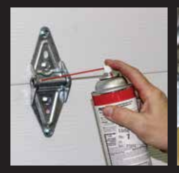
1. Hinges (knuckles)