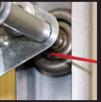
2. Rollers (bearings and shafts)