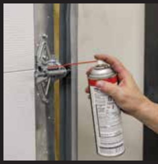
3. Roller Shafts