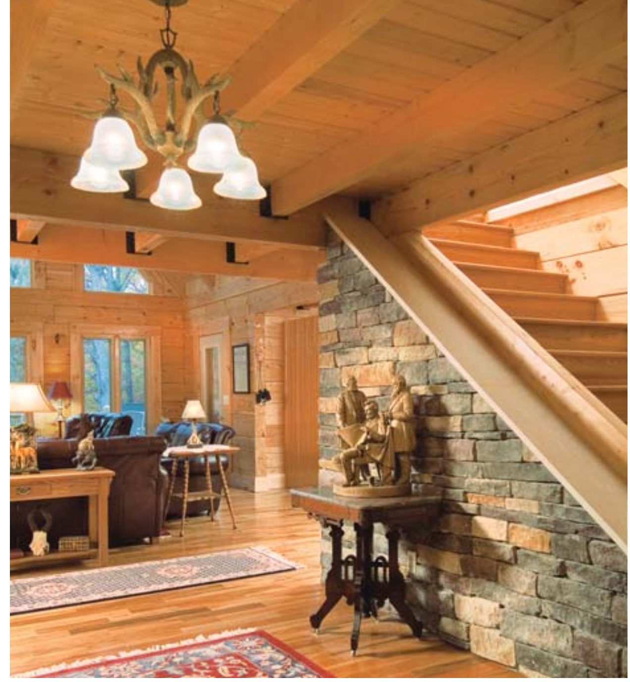
The front stairway, built of leftover fireplace stone, is a strong element in the open foyer. The artwork on the antique table is a John Rogers statue, "Council of War."