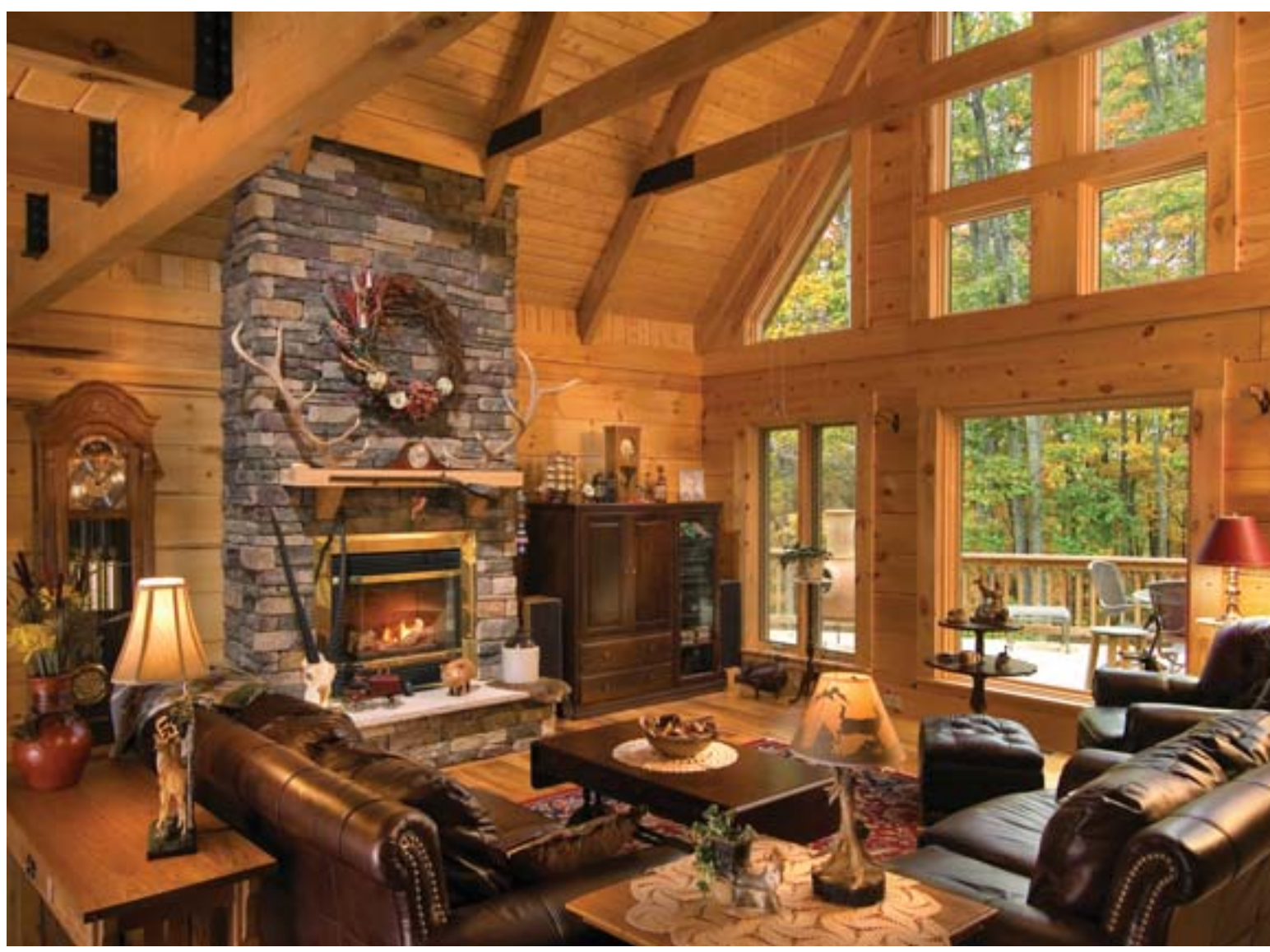
The great room is Jerry's favorite space. It features a large expanse of windows and easy access to the deck. The dry-stacked fireplace is built with Huron Heritage stone, an architectural rock that has the look of real stone, but is a fraction of the cost to install.