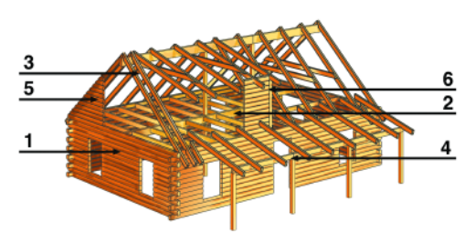
$15-$20 SQ. FT.