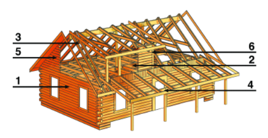
$20-$25 SQ. FT.