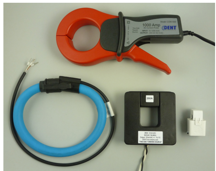
Figure 3: Current transformers available with the ELITEpro.

With precise measurement instrumentation such as the DENT ELITEpro energy logger monitoring energy use, UC Davis's biology laboratories have become "green laboratories." And the policies in place at UC Davis have caught the attention of manufacturers. With efficient new freezers, retiring old freezers, and operating them most efficiently, UC Davis could save tens of thousands of dollars in electricity each year. The really big picture is that plug load in modern molecular biology laboratories can average under 2 Watts per square foot for an entire floor. Even equipment rooms are only about 10 W/SF. This has dramatic implications for downsizing and locating cooling vents and air conditioner downsizing. "Other university labs would be well-served by putting DENT equipment into service," concludes Doyle." To add action to his conviction, Doyle is launching a green laboratory certification program which touches on several different areas including water use and disposal of chemicals in addition to energy consumption. "It's a very in-depth green lab certification process," said Doyle. Referring to the US construction industry's Leadership in Energy & Environmental Design (LEED) program, Allen says that UC Davis green labs program is "like LEED for Labs: Operations and Maintenance." ♦