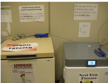
Figure 1: Two of the freezers in UC Davis' biology labs, with DENT Instruments' ELITEpro power meters installed. The wall signs show that newer, more energy efficient freezers consume significantly less power than older, less efficient ones (4kWh versus 26 kWh per day).