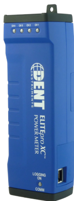
The ELITEpro XC Power Meter from DENT Instruments

Normally, one thinks of a biological research facility as a place where research is done on organic material only. But that's only part of the story at University of California at Davis. It turns out that the university's labs are also where some interesting ad hoc research is happening relating to the efficiency and management of refrigeration technologies.