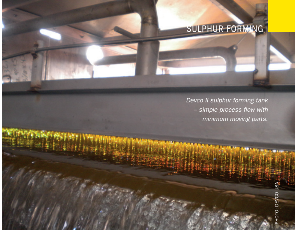
Devco II sulphur forming tank – simple process flow with minimum moving parts.

Wet prilling units have long been understood to be the most capital friendly technology, even by parties who choose other methods to form sulphur. This comes from a variety of factors, including the aforementioned simple process design with minimal mechanical equipment. In most climates where sulphur production takes place, there is no need for a process building. The unit can operate outdoors, saving not