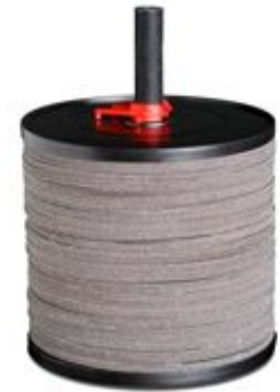
Spindle only available