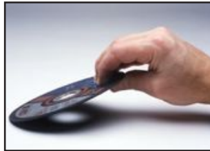
ZA36-T - Rigid