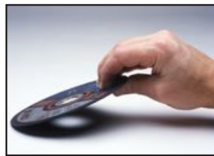
WA36-T - Rigid