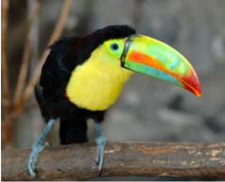
Common Bird in Costa Rica