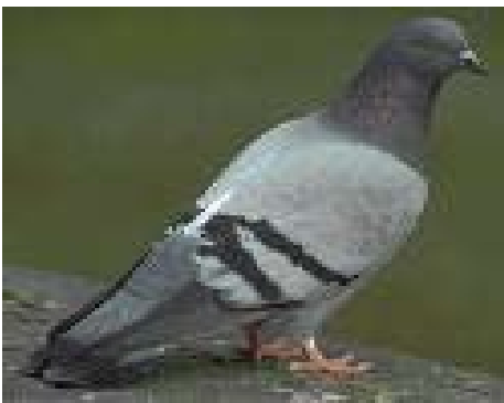
Common Bird in the USA

The second quarter was a busy one as we led another group of guests on a tour of Costa Rica. In June we escorted new friends throughout the central and southern Pacific Region of Costa Rica, from San Jose through Manuel Antonio, Dominical and onto Ojochal. We rode horses, swam in waterfalls, surfed, hiked in national parks and spent plenty of leisure time in lush tropical settings. Some in our group were lucky enough to witness a sloth crossing the road (a rarity if you recall from our last newsletter). You can find pictures from our trip on the following page. If you would like to join an upcoming tour please let us know. The spots do tend to fill up quickly.