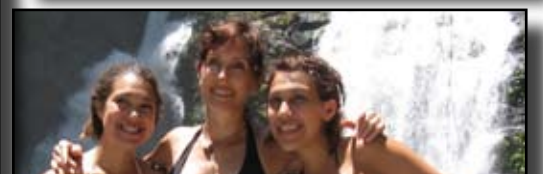
The June 2007 Tour Group