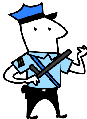
This isn't him.