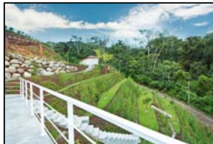
Figure 1. Terraced slope at Angstadt Residence, Ojochal

Figure 1. shows a stabilized slope. It has the desired gradient, presence of plantings as erosion control agents, and the required size concrete gutters to manage peak rainstorm demands.