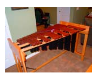
The Beautiful and large Marimba

Both of them love cooking, enjoy watching wildlife, spending time at the beach, and exploring Costa Rica. Since they started coming to Costa Rica a few years ago, they've made quite a few friends around the country, and feel like they already have a support structure in place if they decide to make the move permanently. They're both looking forward to building a house in Tropicos Verde very soon.