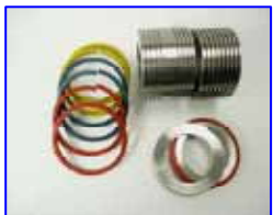
Creasing Cassette Parts Fixed Female shown at left

1 x Male Blade Holder (MT-BH-02/35): used to hold the perforating blade whilst material is fed through