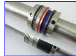
Crease & Perf

The creasing unit is supplied with either a fixed female or a bearing female.