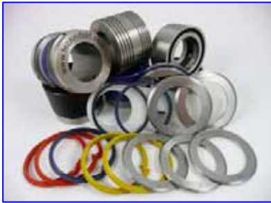
Contents of Combo Kit