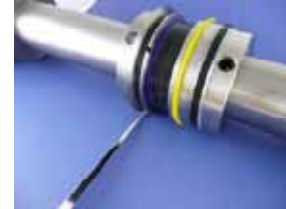
Crease & Cut