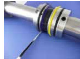
Crease & Cut