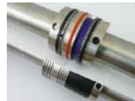
Crease & Perf