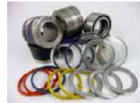
Full Multi-Tool Combo