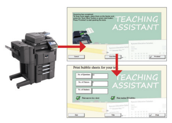
Print answer sheets directly from MFP panel. Test sheets are scanned into the application for grading.

Tests can be created on-the-fly. If some students are struggling in a particular subject area, teachers can create a test to fill specific learning gaps.