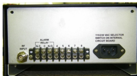
Rear view of MR-5