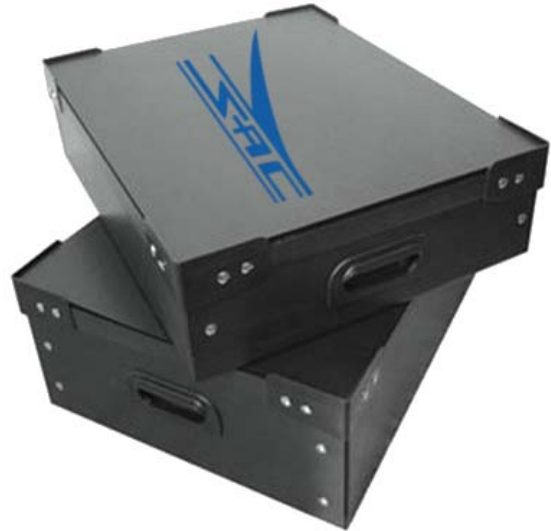
CURIGATED PLASTIC STRAGE CASE, WITH CUSTOM LASER CUT ANIT-STATIC FOAM HOUSING FOR EQUIPMENT

With the test equipment essential for troubleshooting and three critical system modules, the Field Repair Kit includes everything needed to make effective and efficient "in the field" repairs to a SAC NDB System. The antenna simulator and test load allow each section of the system to be isolated ensuring proper functionality, therefore isolating the issue. If a module needs to be replaced, simply exchange it for the new module in the Field Repair Kit, and send the failed module to SAC for repairs. Having the test equipment and modules on hand can greatly reduce system downtime, and even reduce the need for a service call. Save time, money and undue stress; own a Field Repair Kit.