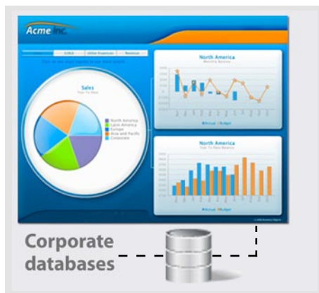
Figure 1: Sample Visual Model of Corporate Data

Best of all, SAP Crystal Dashboard Design, personal edition, updates models in real time. So you can be confident