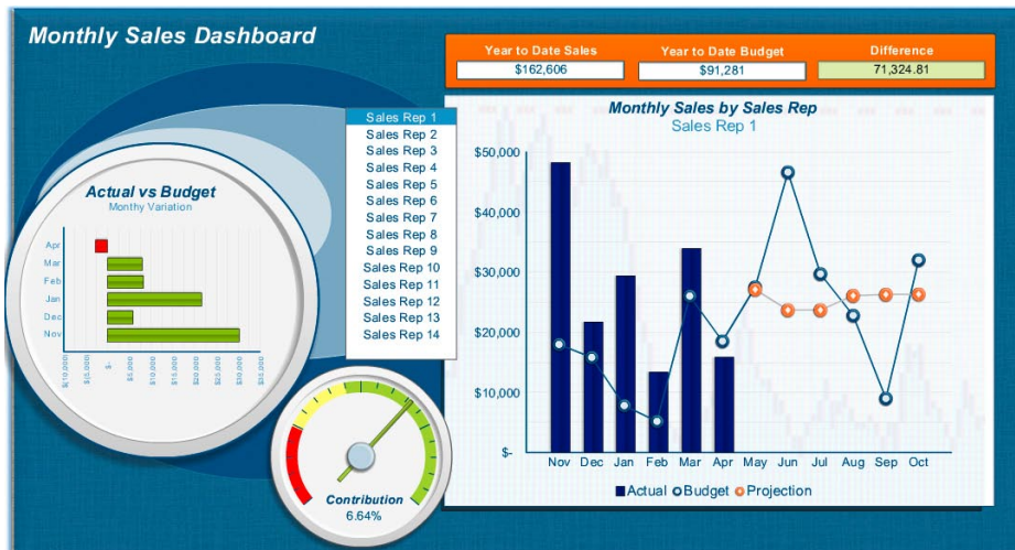
Figure 2: Sales Dashboard

that you're making decisions based on the most accurate data available – whenever or wherever you view the data.